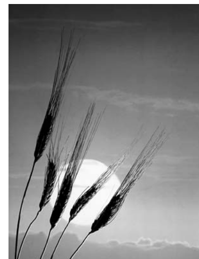
Bringing hope to rural communities

However, the RSS wants your congregation (or individual members) to consider donating directly to a Rural Chaplain's Fund. This will sustain the work of rural mission beyond the immediacy of drought relief. The RSS will provide an annual report on how these donations have been used.