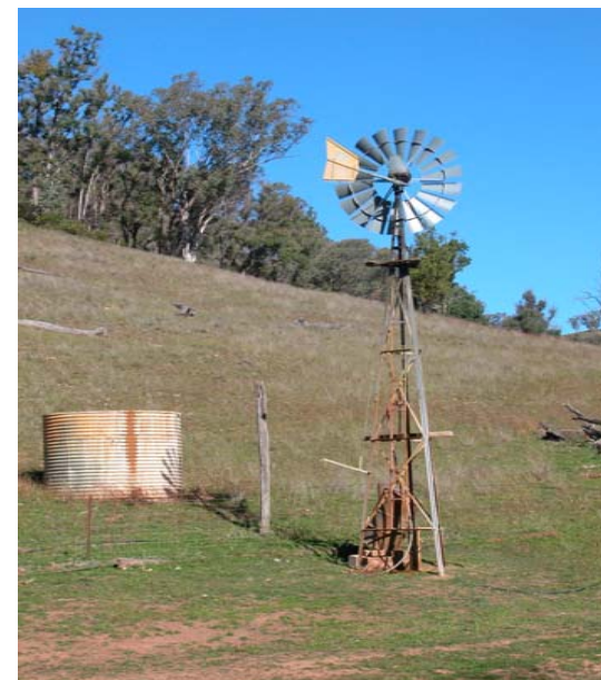
Assisting Rural Families and Communities