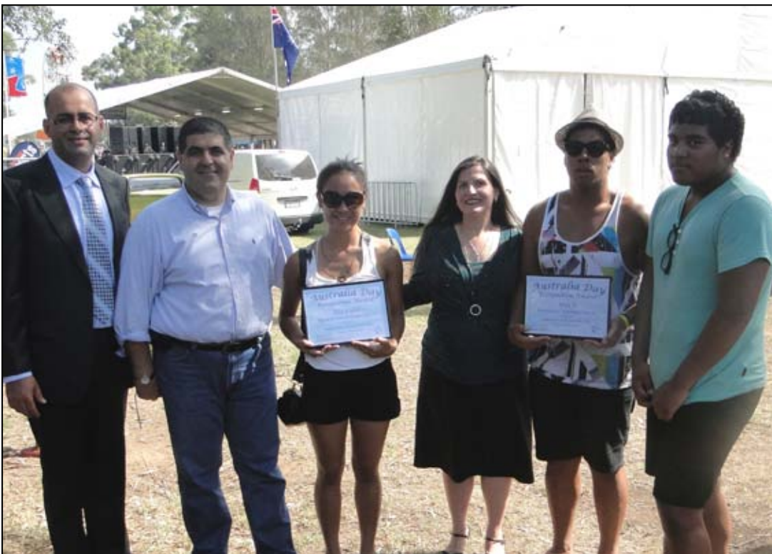
Picture: the Bankstown UC Youth Group are with the Mayor Councillor Tania Mihailuk and Deputy Mayor Councillor Khal Asfour

The celebrations end edat 9pm with the Torch firework display.